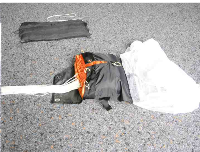
12. Put the S-folded canopy in the deployment bag.