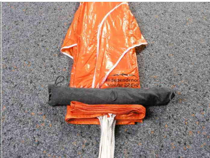
8. Fold the parachute like a "S", and pull out the Ram-Air-Pockets a little bit to the side.