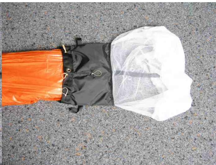
10. Stow the top canopy into the deployment bag.