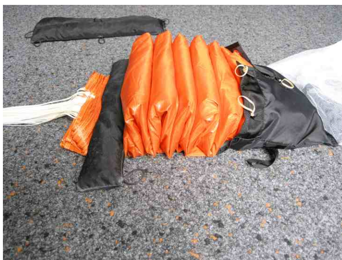
11. Fold the rest of the canopy in small S-folds and place it in front of the deployment bag.