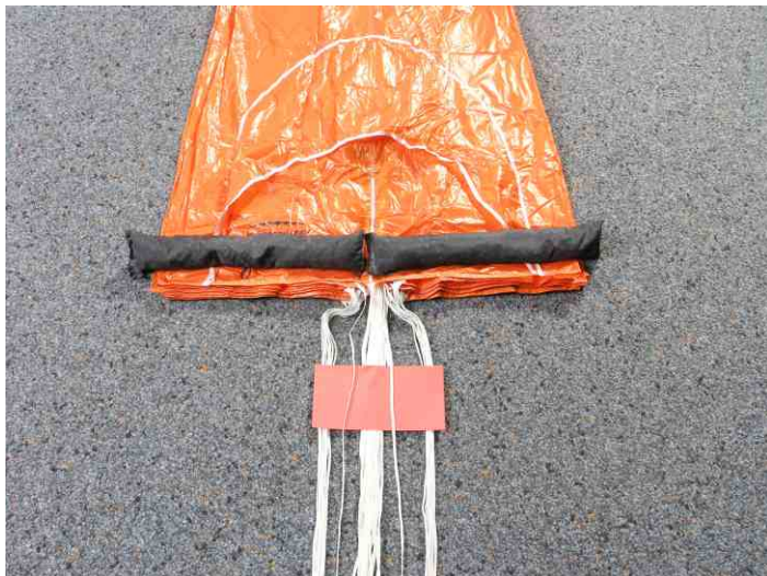
7. Check that line 1 and 20 (Annular EVO 20) and the center line are not twisted and running free. (Annular EVO 22/22HG: 1 and 22; Annular EVO 24/24HG: 1 and 24; Annular EVO Tandem/ Tandem HG: 1 and 30)