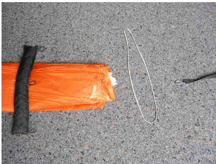
9. Remove the packing cord!