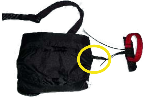
Connection to the Handle