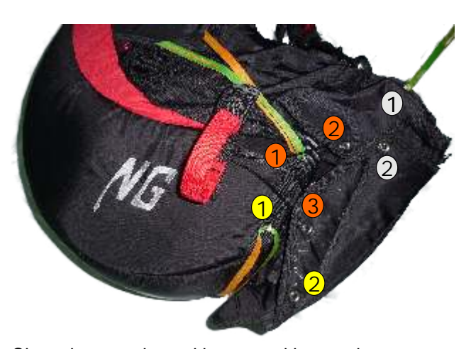
Close the container with two packing cords. Order: