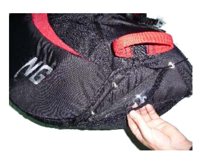
After closing the container, by putting in the pins, remove the packing cords and put the release-handle in the therefore assigned pockets