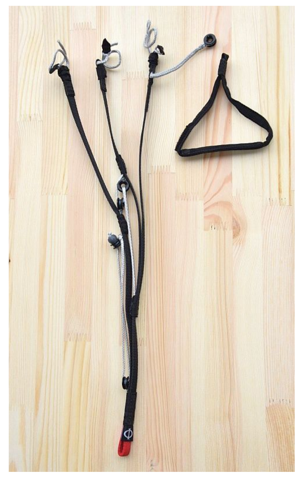
The mounting of the softlink riser / line connection is demanding! It should be done by an expert: service workshop or flying instructor.