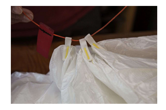
Sort out the suspension lines.

To help you pack the rescue system, use a short piece of old paraglider line and thread it through all the apex fixing loops. The fixing loops are sewn on the canopy.