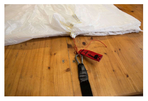
Attach the line to a stable fixed point.