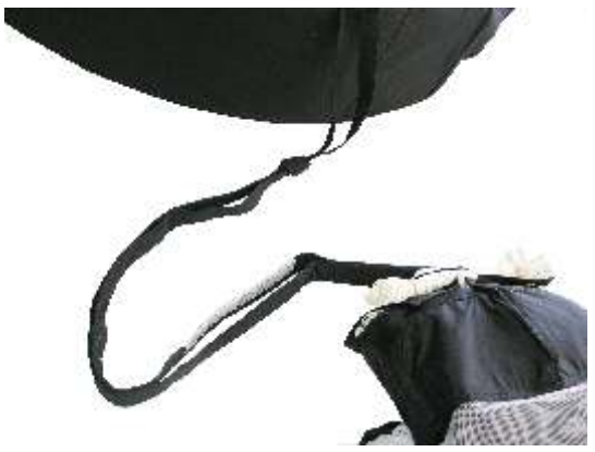
Connection to the Harness