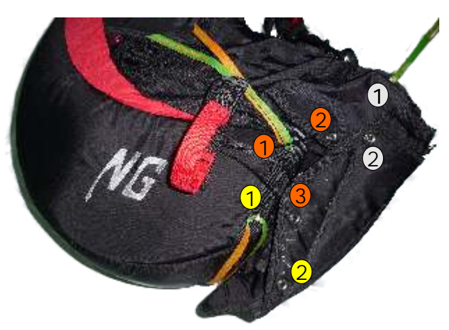
Close the container with two packing cords. Order: