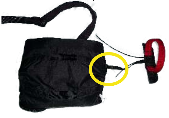
Connection to the Handle