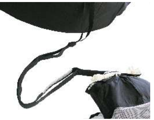
As last step secure one of the pins with a special thread to avoid an unintentional opening. (see next point)..

After closing the container, by putting in the pins, remove the packing cords and put the release-handle in the therefore assigned